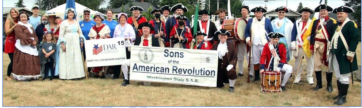
Combined SAR DAR parade group